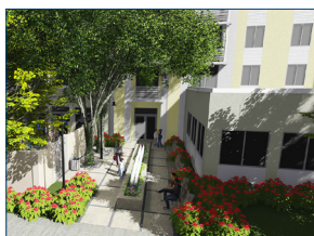
Pictured above: architectural rendering of project upon completion.