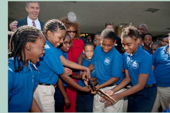
KIPP Schools, Jacksonville college preparatory charter school $26.2 million project $15 million FCLF NMTC Allocation

The NMTC program can help schools that serve low-income students and underserved communities to expand and offer an emphasis on learning and preparing for college or career.