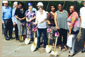
CASA, St. Petersburg domestic violence shelter & services $12 million project $12 million FCLF NMTC Allocation $4.8 million FCLF State Allocation