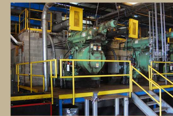
Quitman Torrefaction, Quitman MS torrefied wood, coal-alternative fuel $50.3 million project $3.5 million FCLF NMTC Allocation