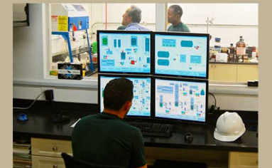
Green Biofuels, Miami green fuel production facility $30.5 million project $9.1 million FCLF NMTC Allocation