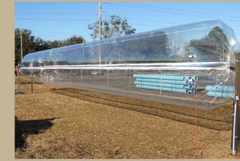
Solar Sink, Tallahassee manufacturing solar energy technology $16.6 million project $12.5 million FCLF NMTC Allocation

FCLF's NMTC Program is focused on projects that produce renewable energy or improved environmental outcomes while creating jobs in low-income communities.