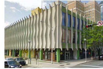
Haydon Burns Library, Jacksonville redevelopment of historic building $23.7 million project $10 million FCLF NMTC Allocation