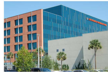
Wexford Science + Technology, Miami biomedical research & business incubator $116.8 million project $5.7 million FCLF NMTC Allocation

High-profile projects in urban areas serve as a catalyst for other economic development, often as part of a redevelopment plan, and create jobs in low-income census tracts.