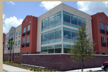
Metropolitan Ministries, Tampa transitional housing & homeless services $19.3 million project $10 million FCLF NMTC Allocation