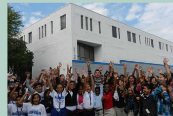
ASPIRA EMH School, Miami education & leadership, Latino youth $9 million project $8.9 million FCLF NMTC Allocation