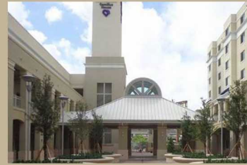
Camillus House, Miami human services, homeless & at-risk $37.4 million project $20 million FCLF NMTC Allocation

From providing medical care for the homeless, to day care for the aging and help for domestic violence victims, community facilities offer a wide array of uses for the NMTC Program.