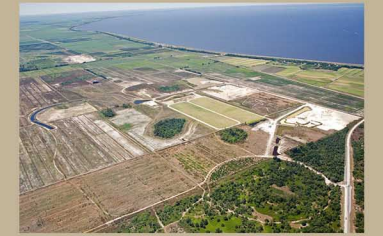
Lake Point Restoration, Martin County public-private water treatment & storage $30.2 million project $16 million FCLF NMTC Allocation