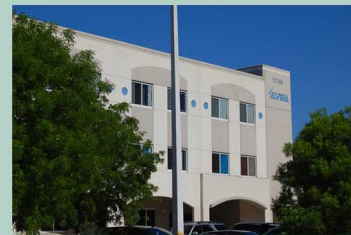
ASPIRA North School, Miami education & leadership, Latino youth $8.2 million project $8.3 million FCLF NMTC Allocation