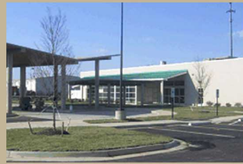
New Manchester Flats II, Richmond VA daily care & programs for senior citizens $7.5 million project $1 million FCLF NMTC Allocation