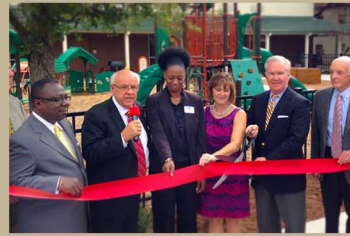
Metropolitan Ministries Phase II, Tampa & Pasco County homeless services & programs $16.7 million project $11 million FCLF NMTC Allocation