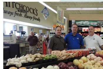
Hitchcock's Market, Old Town FL grocery store in USDA food desert $7.3 million project $2 million FCLF NMTC Allocation

Expanding into food access financing is a focus of FCLF's most recent strategic plan. USDA designation as a food desert is one qualifier for NMTC projects.